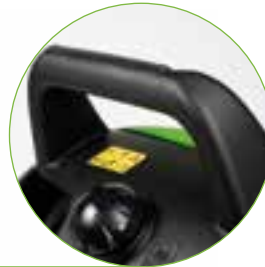
HANDLE Sturdy ergonomic handle for convenient easy manoeuvring.