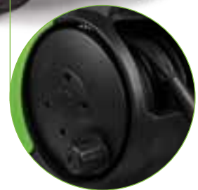
HOSE REEL Manual hose reel, enabling the hose to be stored simply, protecting it from all damage (Standard in PLUS Models).