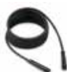
Flexible hose 15 m Code TBAP 40062 20 m Code TBAP 44379