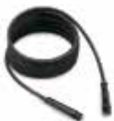
H.P. flexible hose 10 m Code TBAP 25324